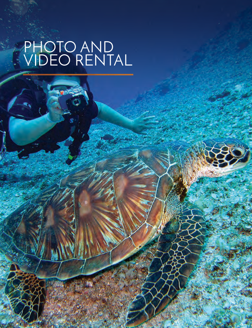
PHOTO AND VIDEO RENTAL

Rent our digital photo camera or Go Pro video camera to capture treasured moments. Take all of the oceans good memories home with you in stunning high definition!